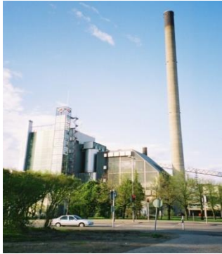
Waste to Energy